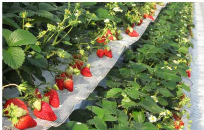
Summer and autumn strawberry (sample image)

—Contribute to local revitalization and agricultural competitiveness of Japan—